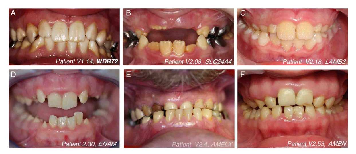
Figure 3 The variety of isolated amelogenesis imperfecta phenotypes seen in this cohort. Representative images of the enamel phenotype associated with mutations in different genes. The mutated gene and patient number are indicated in each panel.